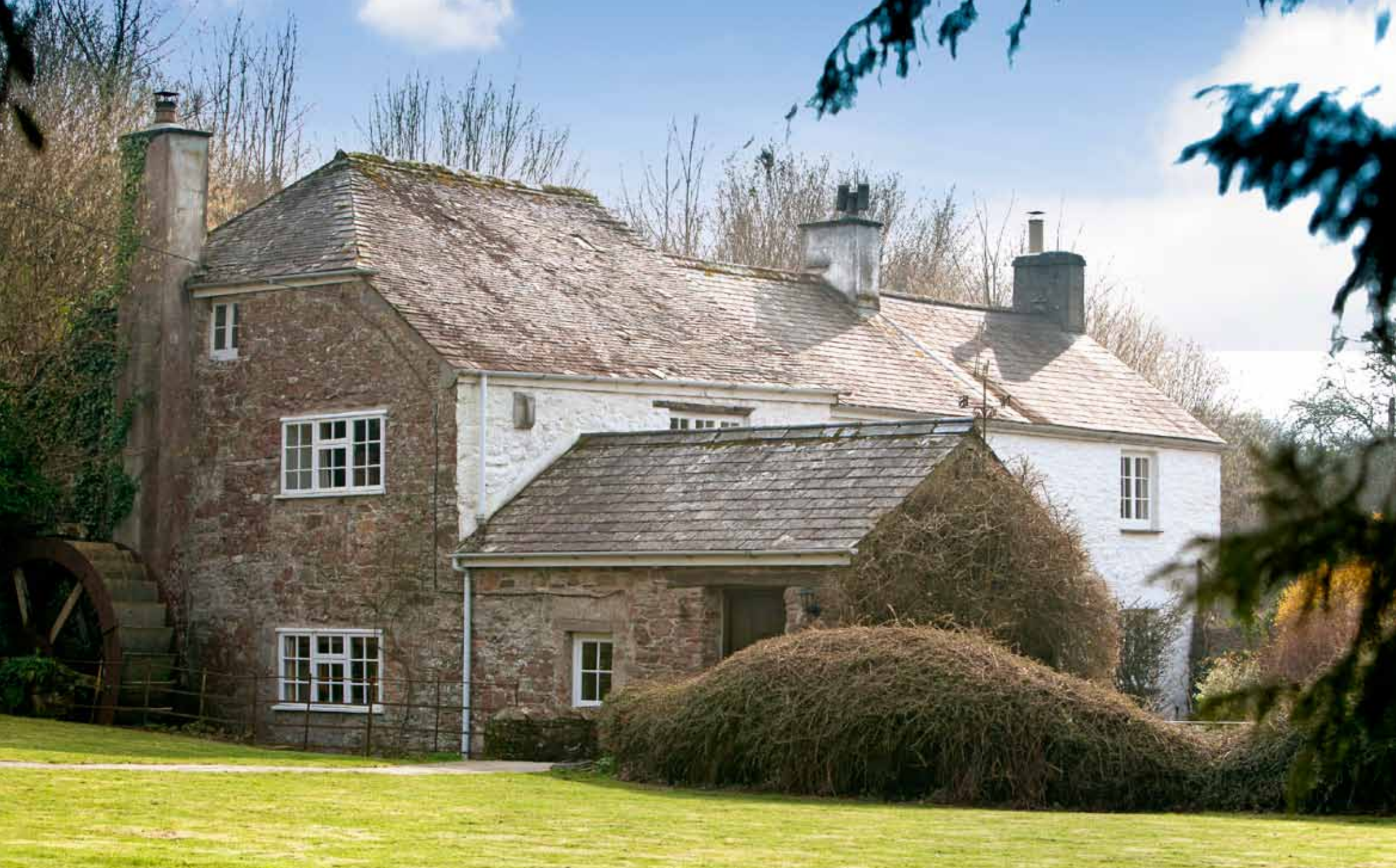
Orcheton Mill, Modbury, Ivybridge, Devon